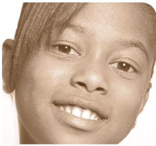
Promoting Alternative Thinking Strategies (PATHS)

Mt. Hope Family Center provides five evidence-based clinical intervention and prevention services. We help approximately 900 at-risk children and families annually through our clinical programs and research projects, and even more through community outreach and collaboratives. All services receive rigorous scientific evaluation and efficacy validation at the Center and other locations. The Monroe County Department of Human Services, state and federal grants, the United Way of Greater Rochester, and private donations fund these services.