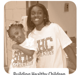
Building Healthy Children

Status: CONNECT completed initial data collection in 2010. NINR extended funding into 2011 that allowed longitudinal follow-up with the participants. The findings will appear in a future issue of Development and Psychopathology .